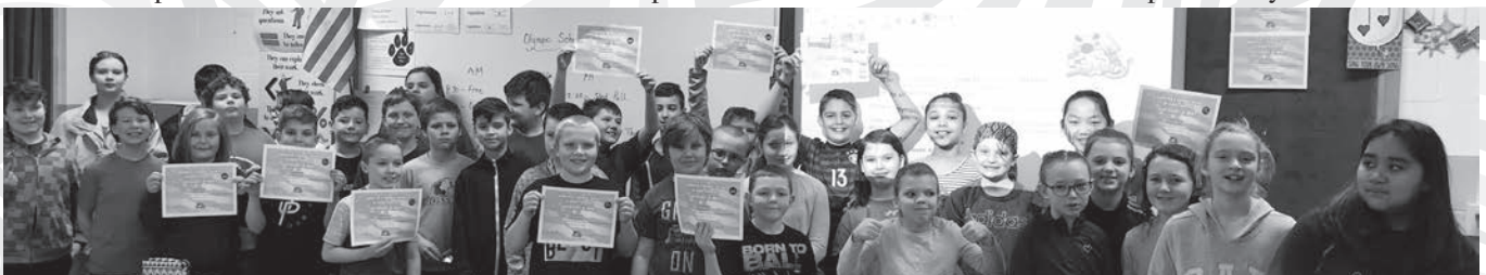
Greenlawn students achieving Top 50 Student status.